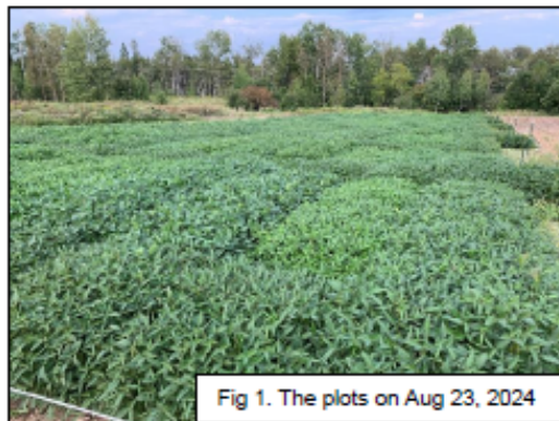
Fig 1. The plots on Aug 23, 2024