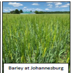
Barley at Johannesburg