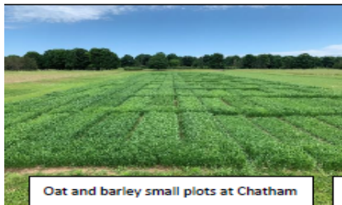
Oat and barley small plots at Chatham