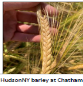
HudsonNY barley at Chatham