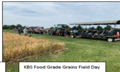
KBS Food Grade Grains Field Day